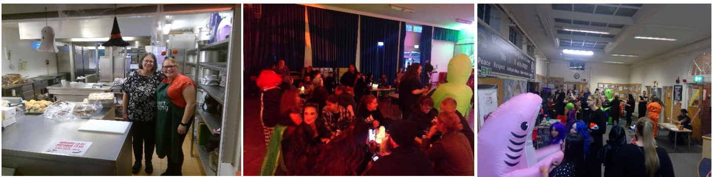
for providing me with a Panda